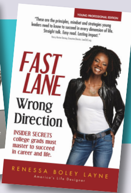
Young Professional Edition